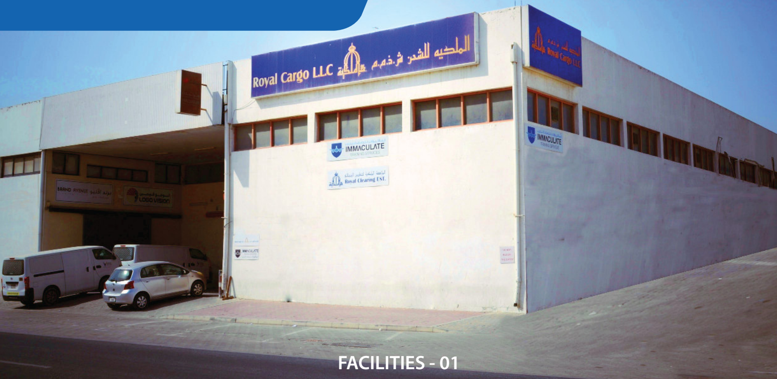
FACILITIES - 01

Royal Cargo offers secure storing and warehousing facilities at strategic locations in in close proximity to Dubai Cargo Village and Jebel Ali. Our warehouses are clean, temperature controlled and have flexible work hours, offering our clients to maximize productivity and minimize travel time between locations to enable better pickup facility and faster turnaround times. At Royal Cargo, we help you to reduce your operating costs and we make sure that operational and safety protocols are carefully followed for all stored goods at our site relieving you of all your worries.